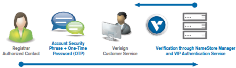
Figure 28-1: Verisign Registry-Registrar Two-Factor Authentication Service