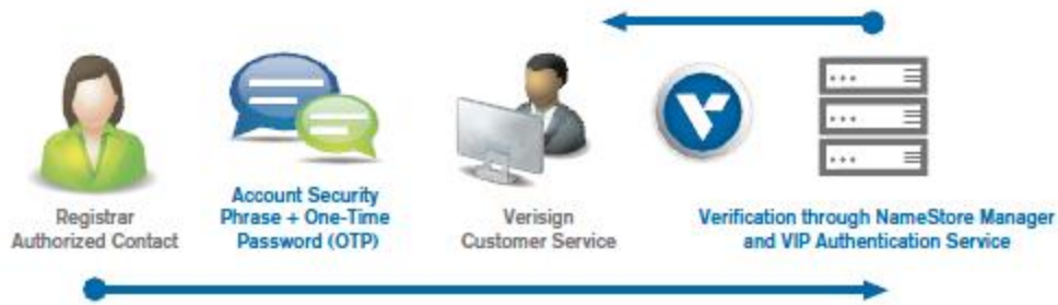
Figure 28-1: Verisign Registry-Registrar Two-Factor Authentication Service