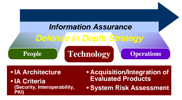
Application of Evaluated Products and Solutions Support of a Layered Defense Strategy

Technology . Today, a wide range of technologies are available for providing Information Assurance services and for detecting intrusions. To insure that the right technologies are procured and deployed, an organization should establish effective policy and processes