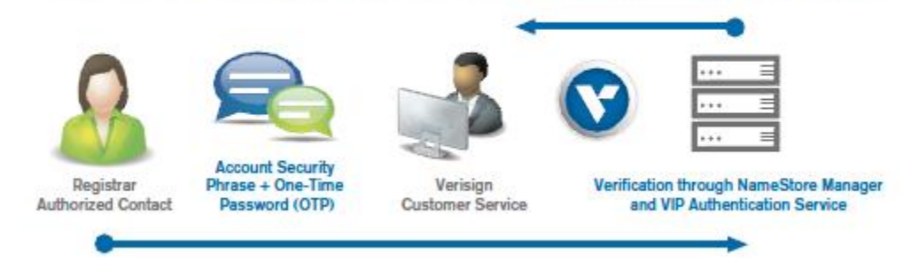
Figure 28-1: Verisign Registry-Registrar Two-Factor Authentication Service