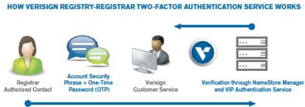
Figure 28-1: Verisign Registry-Registrar Two-Factor Authentication Service